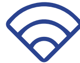
State of Missouri